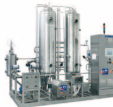
Mixer Symmix for 6,000 gal/h

CFT can provide a vast amount of experience and technology through our processing range of equipment for the Beverage and Food Industries. Fruit & Vegetable Treatment, Syrup Rooms, Saturators, Premix, Flash Pasteurizers (for several applications) and CIP units are manufactured in house and are part of the production program