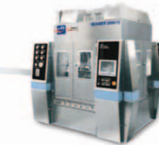
12 heads Seamer

CFT Seaming has manufactured seaming equipment for over 50 years and continues to focus on strengthening our world-wide presence for medium and high speed seaming solutions. The company manufactures all required chucks and rolls in house which provides a huge benefit to end-users and can manufacturers alike.