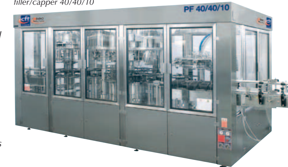
Volumetric blower/filler/capper 40/40/10

The fields of application, both in the supply of individual machines and integrated plants for glass,