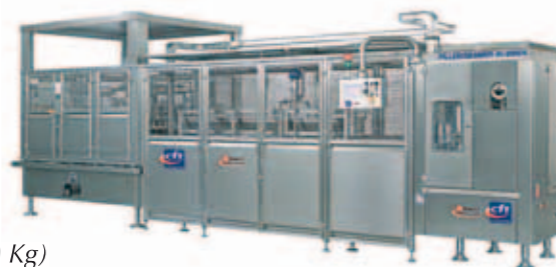
Volumetric filler/seamer 40/6

Comaco provides both independent unit and complete turn-key filling and packaging lines for these niche markets. Comaco has built a strong reputation in working with independent producers and large corporations for cans, pail, and plastic containers (from 0.5 to 1,000 Kg) and has participated in impressive installations in some of the world's leading production facilities.