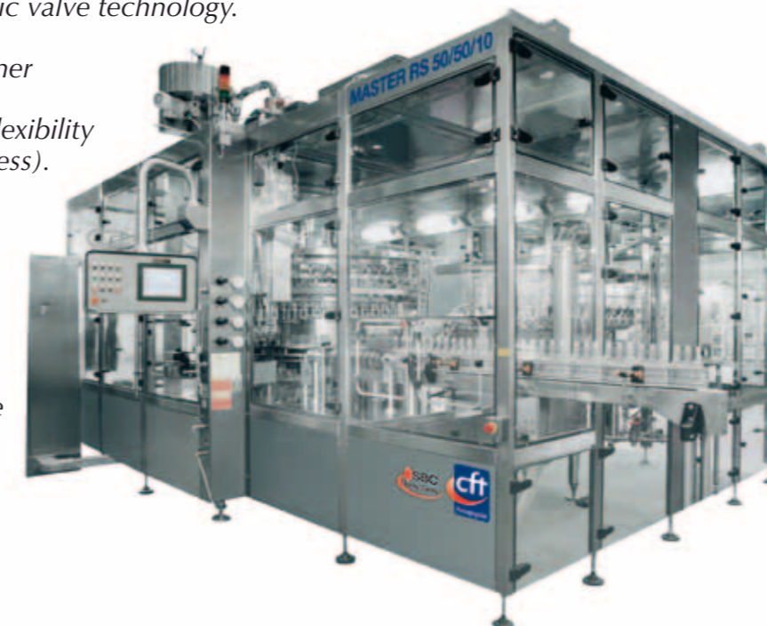
Counterpressure rinser/filler/capper Master RS 50/50/10